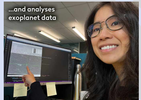
...and analyses exoplanet data

Unfortunately, because I started my PhD during COVID-19, all my conferences have been online. Thankfully, the data for my project has already been collected, so COVID-19 didn't hinder that. Plus, most telescopes don't need you to be there to observe. But there's nothing like doing hands-on observing, so I'm glad that I recently got to go to Mount John Observatory here in New Zealand. It's located in a dark-sky reserve – I'm originally from Singapore and have only ever known light-polluted skies, so I got to see the southern sky for the first time."