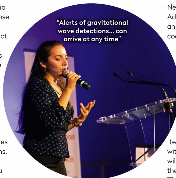
"Alerts of gravitational wave detections... can arrive at any time"

by the interferometers like LIGO (Laser Interferometer Gravitational-Wave Observatory) and Virgo. Meanwhile, the material surrounding these events releases high-energy gamma rays, optical or near-infrared light. Fully observing these events can help us understand how matter behaves under nature's most extreme conditions, but that requires many observations from around the globe. That involves a lot of logistics and communication, but these observations can lead to wonderful discoveries for astrophysics, cosmology and fundamental physics.